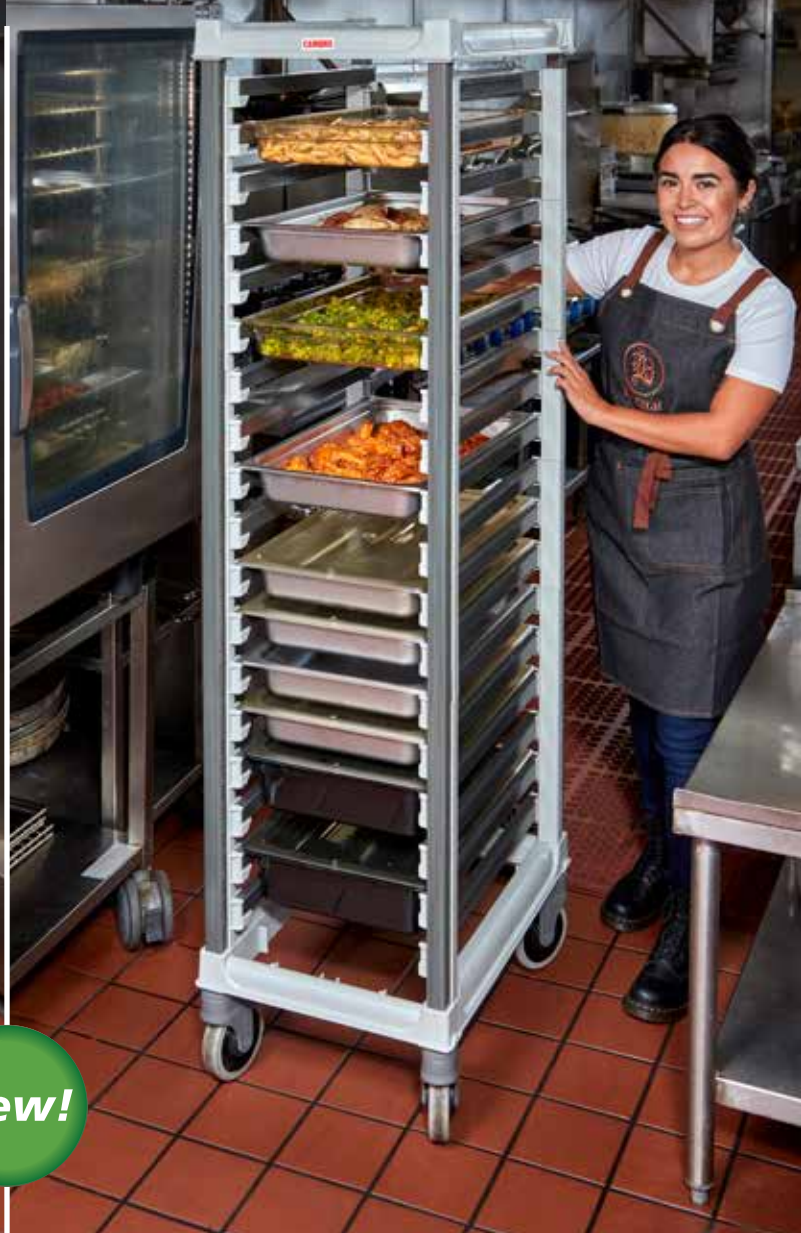
Full Size GN 1/1 Trolley UGNPR11F18

Lifetime Warranty Against Rust and Corrosion