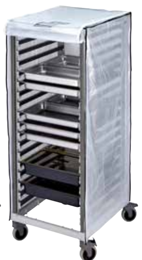
GBCTUGNPR21 Optional Heavy Duty Vinyl Cover for GN 2/1 Full Size Trolley.