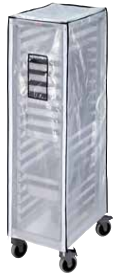
GBCTUGNPR11 Optional Heavy Duty Vinyl Cover for GN 1/1 Full Size Trolley.

All Trolleys ship knockdown (KD) complete in 1 box with casters and bottom frame wedges factory assembled on posts.